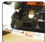
Long life battery